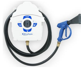
ProTwin Kit for Wet Foam