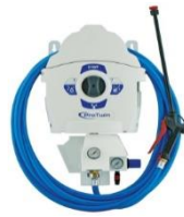
ProTwin Kit for Dry Foam